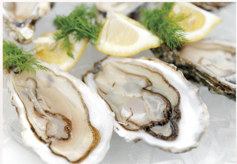
生蚝刺身 时价 POA Oyster