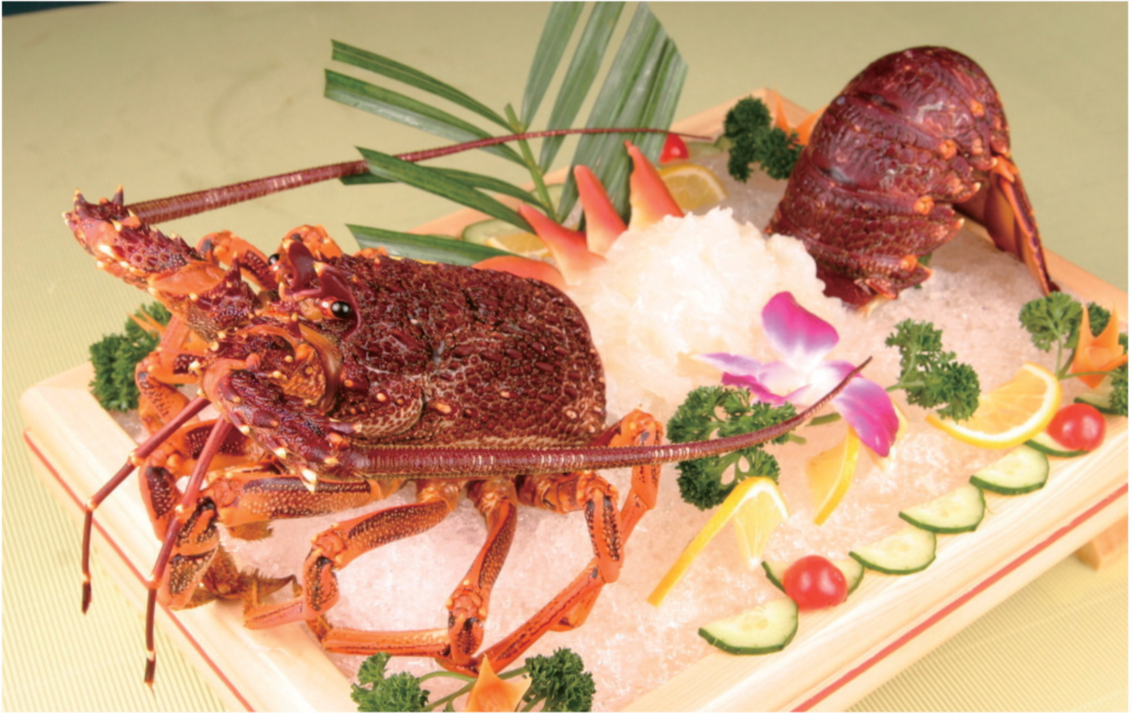
龙虾刺身 时价 POA Lobster