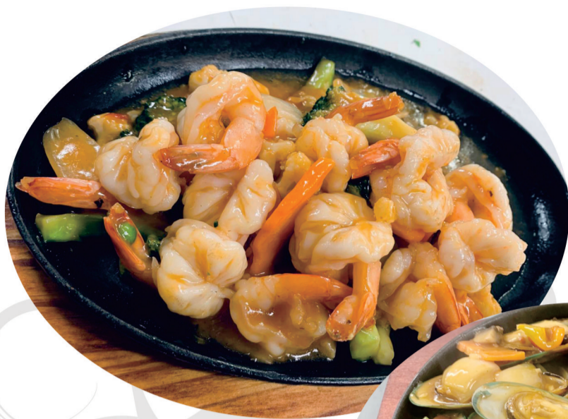
1. 铁板大虾 Sizzling king prawns $40