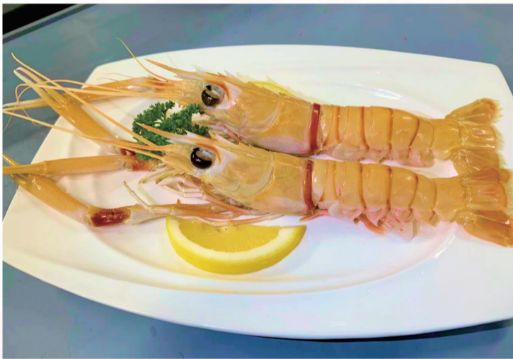
南极甜虾刺身 (1只) Scampi (Size 1) $38 每只 /each