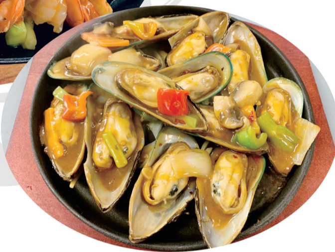
3. 铁板青口 Sizzling Mussel $39