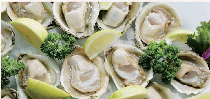
布拉夫生蚝 (季节供应) Bluff Oyster (when in season)